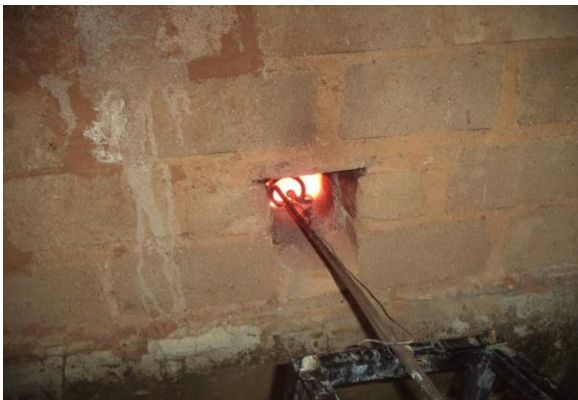
Plate 3: Firing of NBBRI CSEBs

The Compressive Strength test per BS EN 12390 – 3:2000 was carried out using a Compressive Strength Testing Machine [9].