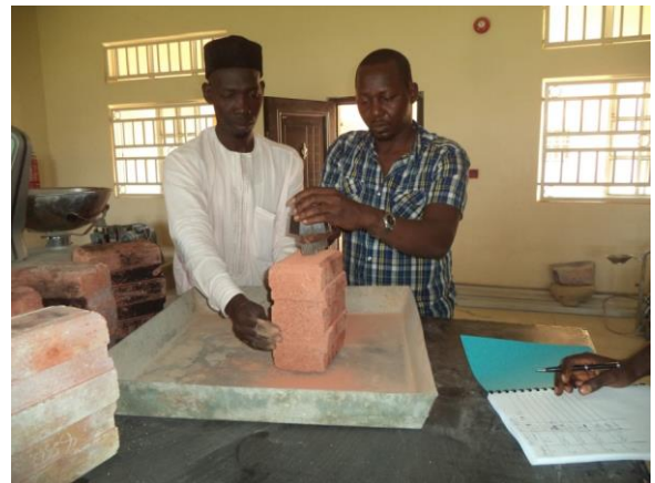
Plate 5: Determination of the Abrasive Strength of NBBRI CSEB

The Abrasive Strength was determined per Standards ARS 674, 675, 676, 677, where the samples were subjected to mechanical erosion applied by brushing them with a metal brush at a constant pressure over a given number cycles [8].