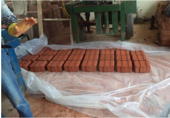
Plate 1: Stacking and Curing of Blocks

and compressed at 20 N/mm 2 to produce Blocks, cured for 21 days.