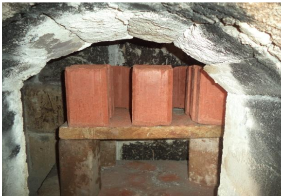
Plate 2: NBBRI CSEBs Samples arranged in Kiln for Firing

Samples were exposed to controlled fire at varying temperatures inside a kiln for 1½ hours, after which the Compressive Strength and the Abrasive Strength of the samples were determined in comparison to the results from unexposed samples. For both compressive and abrasive strength tests, two unfired samples used as a control, along with two fired samples at each different degree Celsius were crushed (as in the case of the compressive test) and brushed (as in the case of the abrasive test) respectively, and the average value of each was recorded.