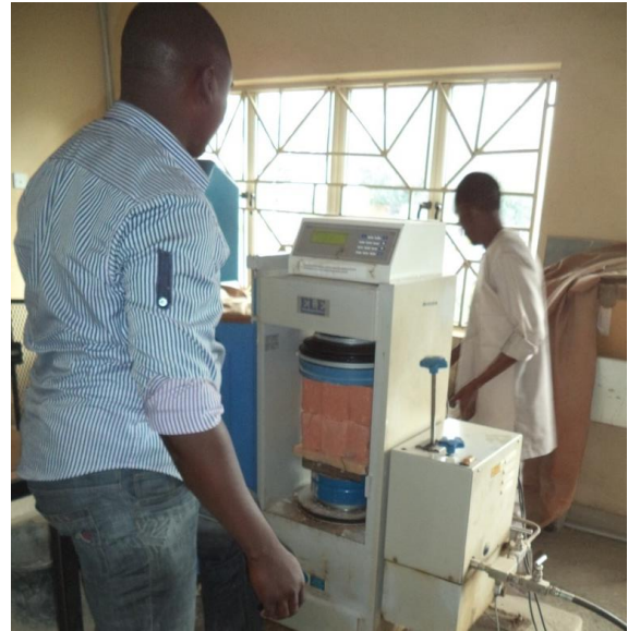
Plate 4: Testing the Compressive Strength of Block sample

The Compressive Strength test per BS EN 12390 – 3:2000 was carried out using a Compressive Strength Testing Machine [9].