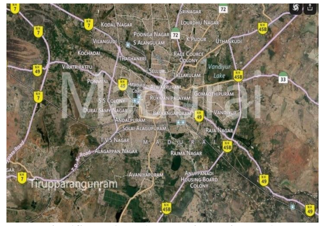
Fig. 1Study Area (Madurai, Tamil Nadu)

The samples required for the study were collected from the MSW plant at vellakkal, as shown in Fig. 2 in Madurai. Vellakkal is located at 9.8745° N, 78.1165° E. In 2004, a study of the waste characterization of solid waste had been conducted by Madurai Corporation; approximately 65.40% of waste is degradable, while the rest is Non-degradable (which mainly includes paper, plastic Gloss).