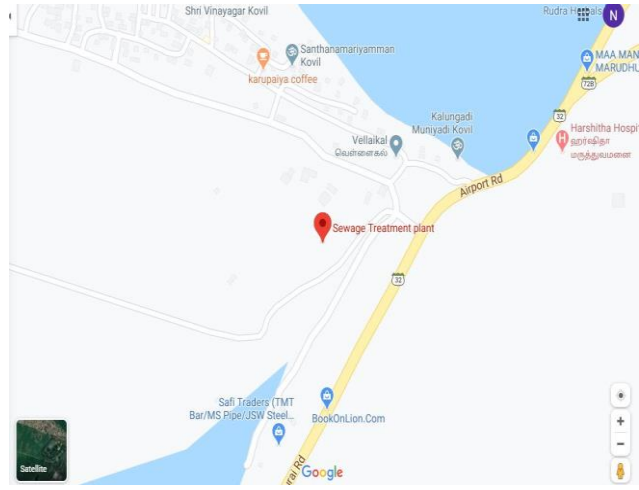
Fig. 2 Vellakal (Municipal Solid Waste Management Plant, Madurai, Tamil Nadu)

The waste samples sieved through 100mm screens were suitable for this study. It had a combination of biodegradable and non-biodegradable waste. We collected a sample of about 12kg for this study, as shown in Fig. 3.