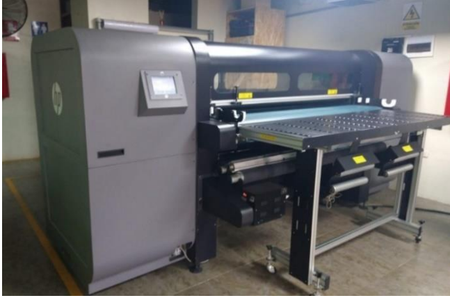
Fig. 2 HP FB 550 Digital Printing Machine

Table 1 shows the preventive maintenance schedule for the HP FB 550 machine, detailing tasks, frequency, required tools, and diagnostic criteria. Tasks are categorized by cleaning, lubrication, and component replacement, aiming to optimize equipment performance and extend operational life. Maintenance frequency varies between 40 to 1000 hours, depending on task criticality.