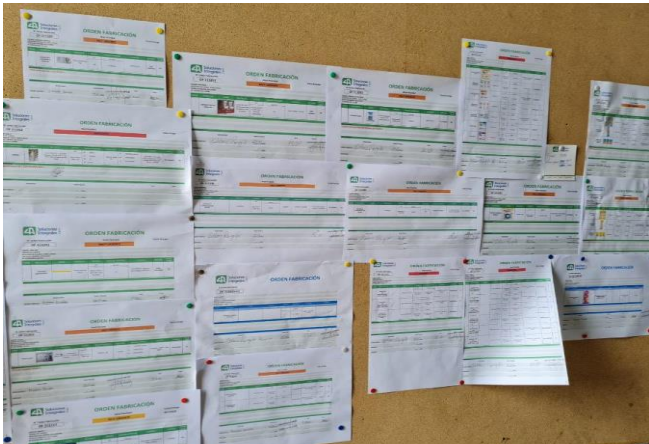
Fig. 3 Inspection Checklists for HP Machine

Figure 3 shows inspection checklists used to monitor maintenance indicators for the HP machine. These checklists assist in assessing processes and classifying states according to their Mean Time Between Failures (MTBF). A traffic light system was implemented to cap the upper limits for each parameter set to avoid delays in intervention and avert failures.