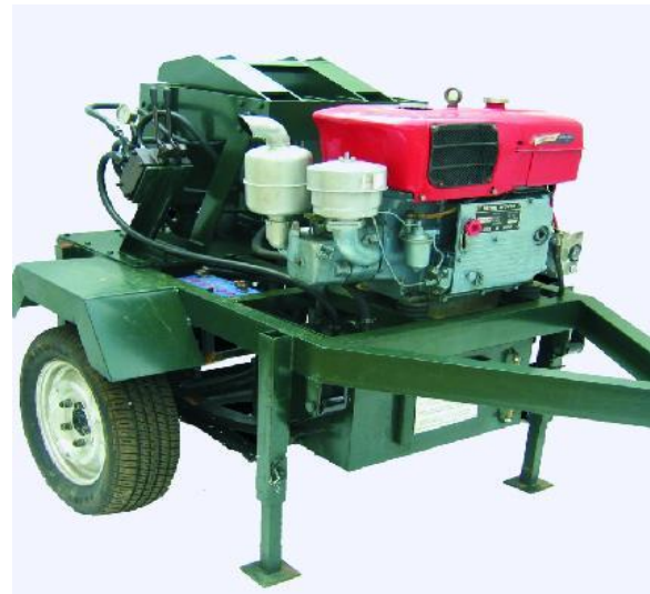
Fig2: NBRRI Interlocking CSEB Making Machine