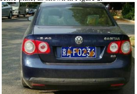
Figure 2 a picture containing a stain on the license plate

In this paper, the license plate area in the image is located at first, then move to the process of the stained license plate image. The picture below is the original picture of the license plate, as shown in Figure 2.