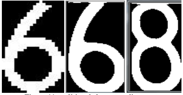
Figure 11 traditional character alignment

A. Traditional method of license plate recognition At present, the technology of license plate recognition is relatively mature, and there are a variety of license plate recognition methods. The recognition rate of the license plate recognition using the traditional template matching method is high in case the plate is clear. In Figure 11, in the traditional license plate recognition method, the first character obtained from the license plate (the first 6 in the following figure) is compared with the characters in the template library (the second number 6 and 8 in the following figure), and then the recognized character is output with the smallest difference value.