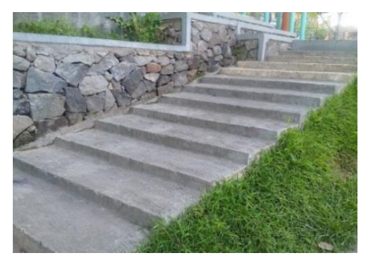
Figure 4. Stairs in one of City Park in Surakarta

One of the important component available in park is stairs. The available stairs must be safe and accessible for citizens, including the difables. There are requirements for stairs so it can be considered as safe stairs for difables. Those requirements of accessible stairs are (a) Having same dimension for steps, (b) at a slope of less than 60 degree, (c) no holes on the steps because it can endanger the stairs users, (d) equipped with handrail at least on one of the side of the stairs, (e) the handrail must be reachable with the height 65-80cm from floor, free from unsuitable constructive elements, and the tips of the handrail must be round or be turned well to floor, wall, or pole, (f) the handrail must be more longer on its upper and lower tips, minimally 30cm, (g) the stairs on the outside must be constructed well so that there will not be puddle on the steps of the stairs (The Minister Regulation Number 30 Year 2006).