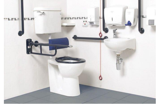
Gambar 3. Difabel-friendly Toilet

There must be an emergency sound button in the reachable spot like on door area.