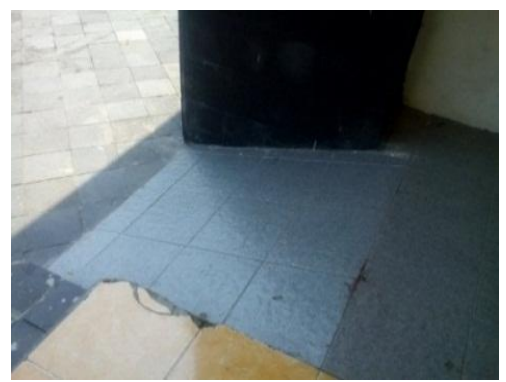
Figure 6. RAM in One of Surakarta City Park

accordance with The Minister Regulation Number 30 Year 2006. Both of the RAMs do not have flat surface on the beginning and the end of the RAM yet and they are not in accordance with the valid standard.