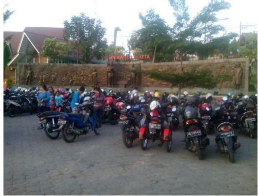
Figure 1. Parking Area in One of Surakarta Parks

From the table above, it can be seen the accessible parking area for the difables. In every 25 availabe parking areas in public facility there must be one parking area for difables. Therefore, it can be concluded that the parking areas in those three parks are not accessible yet for difables.