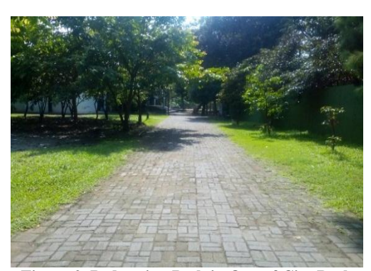
Figure 2. Pedestrian Path in One of City Park

The building of textured blocks for guiding blocks on already existing pedestrian needs to pay attention on the texture of the blocks so, there is no confusion to differ guiding blocks and warning blocks. It is better to give different color on guiding blocks and warning blocks which is usually yellow or orange.